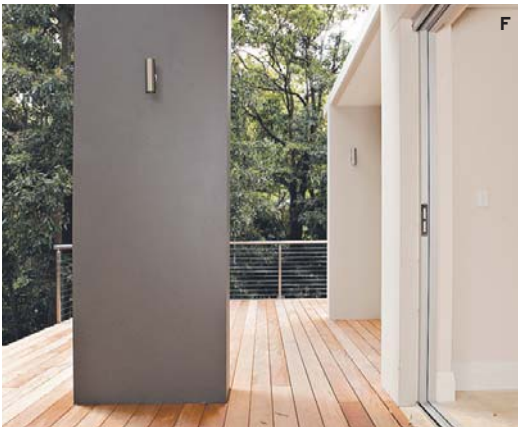
F Floor-to-ceiling bi-fold doors open up to the wraparound deck G Teak veneer and pietra grey marble are featured in the bathroom H The kitchen bench with breakfast bar