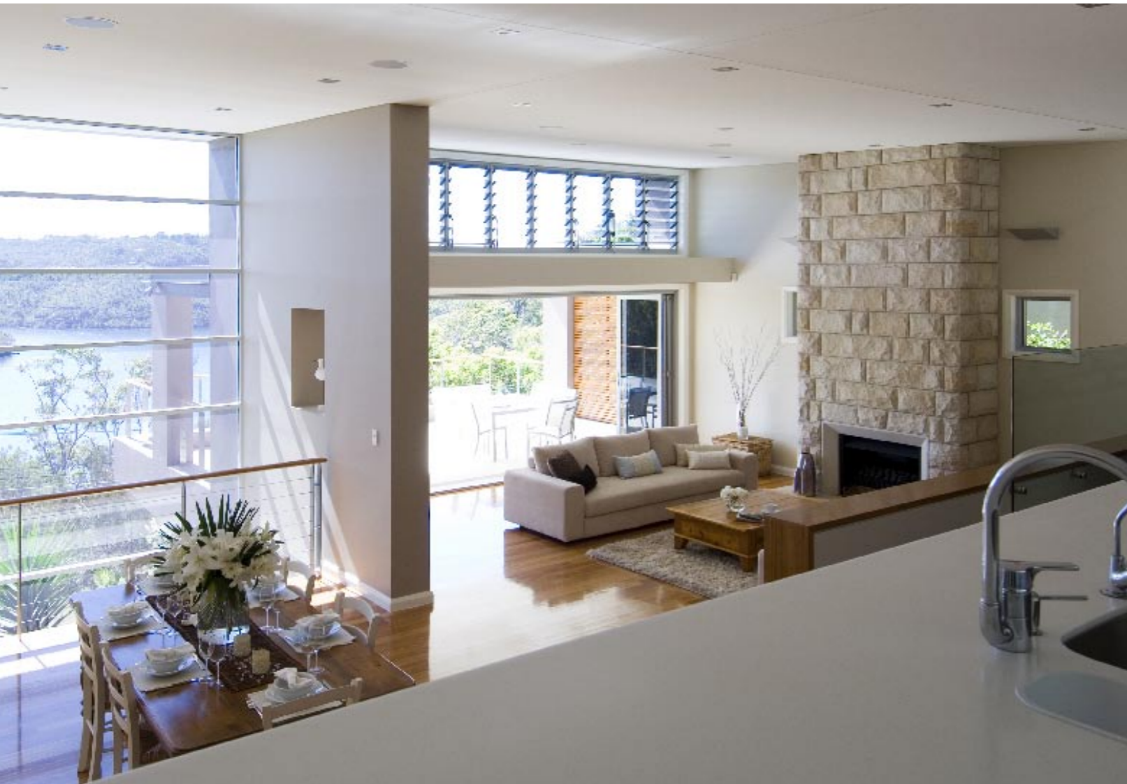
THIS PAGE the upstairs living area opens out to a generous balcony. Outdoor setting from Freedom. OPPOSITE TOP a view from the kitchen, over the dining area, to Garigal National Park. OPPOSITE BOTTOM drawers from Degabriele Kitchens and a Laminex benchtop lend a sleek look the kitchen. For stockists see Buyer's Guide.