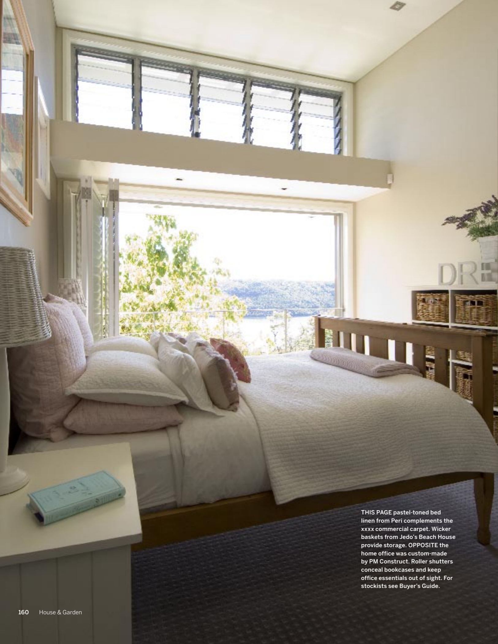
THIS PAGE pastel-toned bed linen from Peri complements the xxx commercial carpet. Wicker baskets from Jedo's Beach House provide storage. OPPOSITE the home office was custom-made by PM Construct. Roller shutters conceal bookcases and keep office essentials out of sight. For stockists see Buyer's Guide.